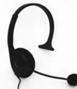
Over-the-Head Mic w/Earphone LA-272