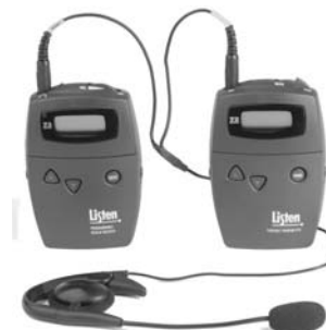
These headsets combine cabling for both a transmitter and a receiver